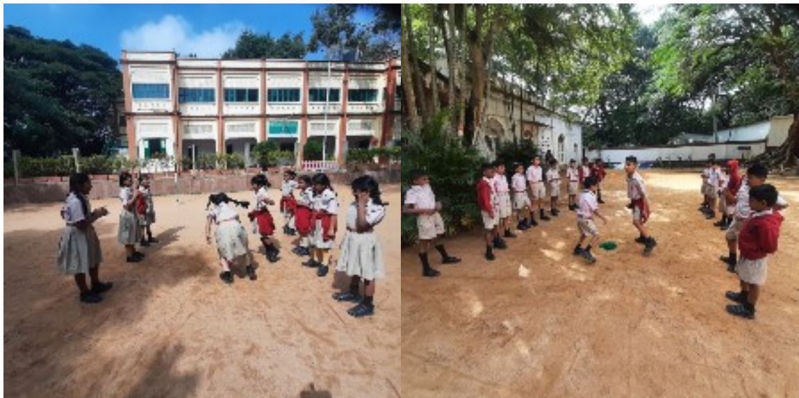
Grade - 2 Dog and the bone game