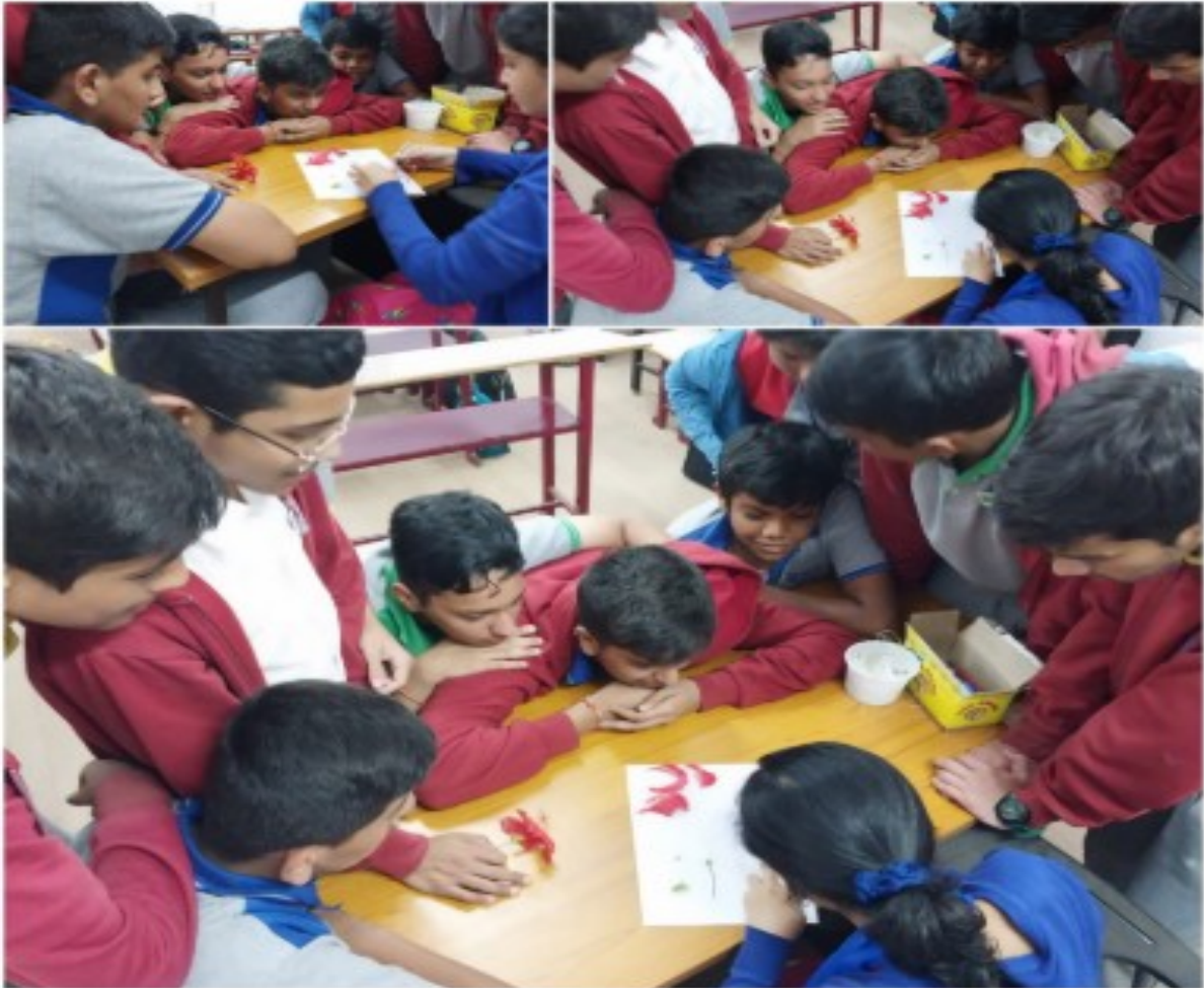
Grade - 10 Hibiscus flower dissection